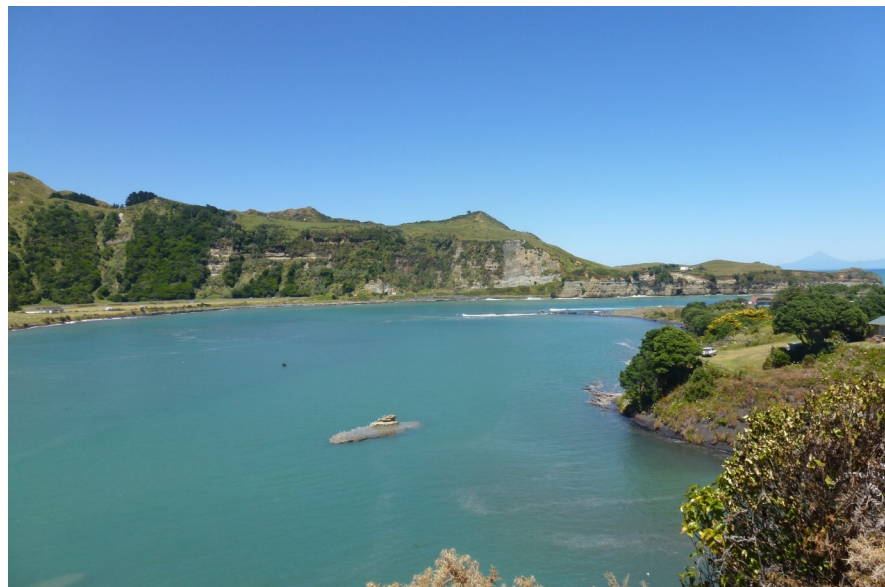
Mokau River & Flower Pot.

Monthly Community Newsletter supporting the Tainui District—Mokau, Awakino, Tongaporutu, Ahititi and Waikawau